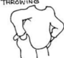
HANDS IN POCKETs