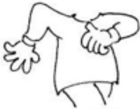
A BRISK WALK