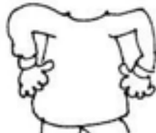
HANDS ON HIPs